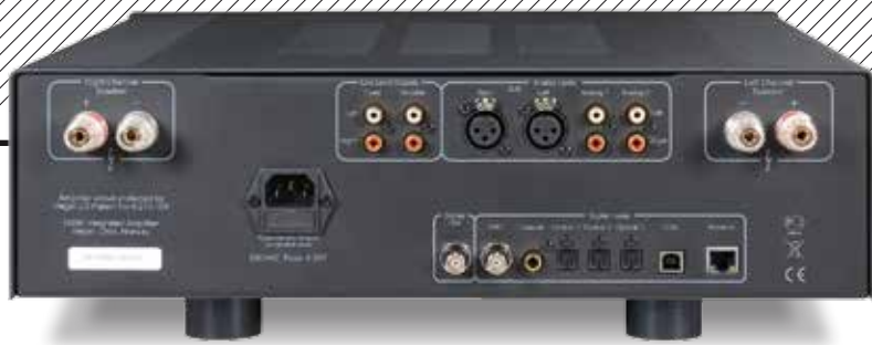
ABOVE: Substantial 4mm speaker outlets, plus fixed and variable preamp outs are joined by three line inputs (one balanced on XLR). The row of digital ins includes three optical, two coax (RCA/BNC), USB-B and an Ethernet port. A digital out (BNC) is added

H590, although the smaller amp does sit on almost comically tall feet, which at least make it easier to access the power switch hidden under the front panel. But you know what I mean about vanishing: it's not a physical thing, as after all the H390 is still a sizeable chunk of 'Nordic noir', but rather a sonic one.